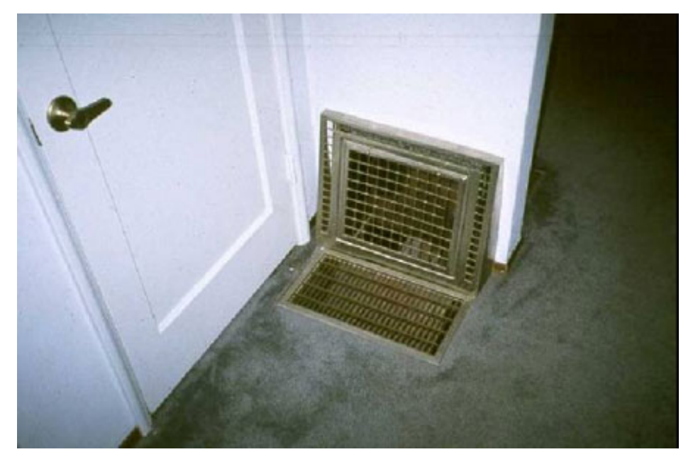
Photo 1 - Floor furnace next to door and within 6 inches of a corner

Both listed and unlisted floor furnaces should have a temperature-limiting device at the register. In unlisted systems, this should shut the system gas flow off should the register temperature reach 350°F. Older systems may not have this feature. The ignition temperature of wood is roughly 450°F to 575°F — depending on species and wood condition. However, wood damaged through pyrolysis (long-term low level heat exposure) may ignite at much lower temperatures. The intent of the temperature-limiting device is to prevent ignition and not to protect the occupants from contact burns. Even in normal operation, floor grills and registers can become very hot. Some sort of protective barrier is advisable if young children are present in the dwelling.