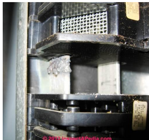
Fig. 9. Burned Zinsco™ Circuit Breaker.