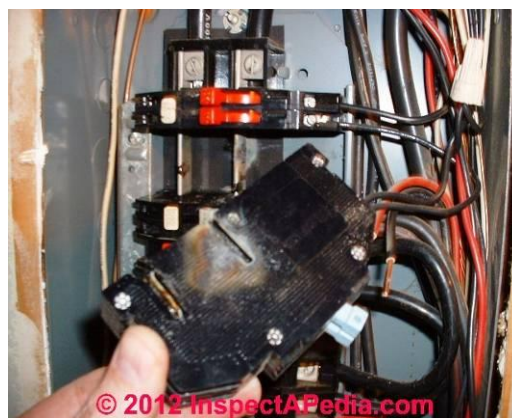
Fig. 8. Zinsco™ Double-Pole Thin Style Breaker, Light Green Toggles, with Burn and Arcing Flash Marks.

Visual inspection cannot identify defective circuit breakers, unless they are already burned or corroded. Property owners should engage a licensed, qualified electrician to conduct a comprehensive electrical inspection and make recommendations.