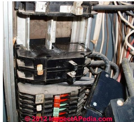
Fig. 6. Zinsco™ Double Pole Breaker in Place, with Panel Bus Exposed.