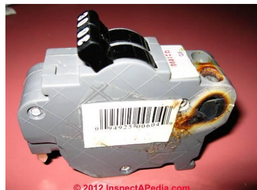
Fig. 7. Burned-Out GTE Sylvania Zinsco™ Circuit Breaker.