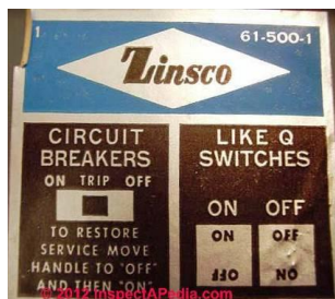
Fig. 1. Zinsco ™

The affected circuit breakers and panels are labeled with various brand names, including any of the following, alone or in combination: Zinsco ™ , Sylvania ™ , GTE ™ , GTE-Sylvania ™ , Magnetrip ™ , and Kearney ™ . Most have a silver, or silver and blue, foil label. The words “Zinsco,” “Sylvania,” or “Magnetrip” may be stamped or embossed on the panel. (Figures 1, 2, 3, and 4) Inside the panel box, the circuit breakers often have bright blue, red, and green tabs.