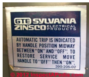
Fig. 2. GTE Sylvania Zinsco ™