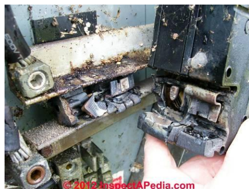
Fig. 10. Burned Zinsco™ Main Circuit Breaker and Burned Zinsco™ Electrical Panel Bus. Image provided courtesy of InspectAPedia.com

Image provided courtesy of InspectAPedia.com