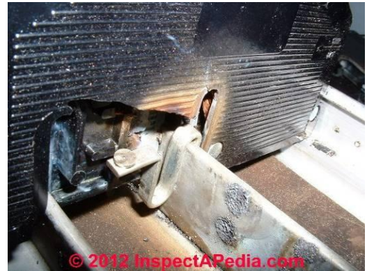
Fig. 5. Zinsco™ Breaker Side Blowout with Breaker Contact Exposed.

Though production of Zinsco™ electrical panels and circuit breakers ended in the mid-1970s, they remain in use in many homes and other buildings throughout the United States. Industry reports indicate that as many as 25% of all Zinsco™ circuit breakers could fail to trip in response to an over-current or short circuit.