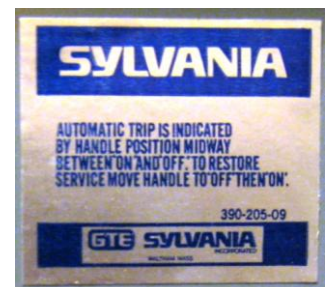
Fig. 4. GTE-Sylvania ™