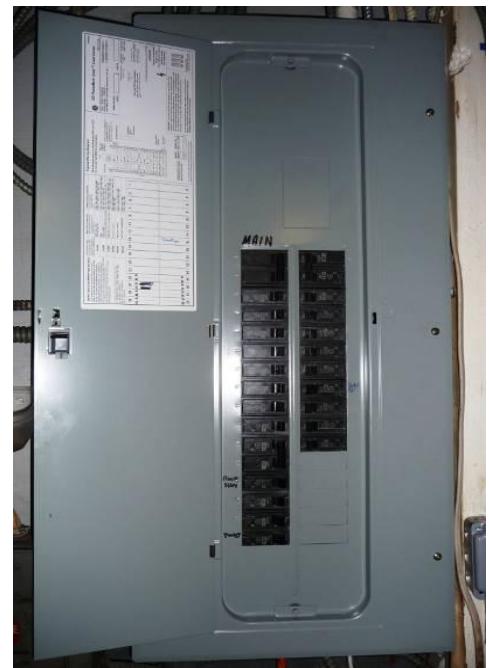
Fig. 11. Replacement Panel.

Live-current functional testing can be extremely hazardous, as it creates dangerous current overload conditions in the building. In addition, running an overload test on a Zinsco™ breaker can actually intensify its inherent hazard, as the overload may cause the breaker to jam, increasing the risk that it will fail to trip in the future.