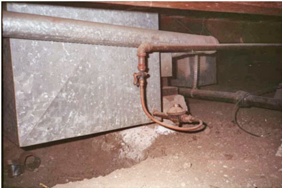
Photo 4 - Non-Safety Pilot system – Also note Condensation on Soils below Draft Hood

An improvement on the older gas systems is the "90% safety" type. These have a thermocouple linked to the valve controlling the burners, but not the pilot. With these systems there are usually separate "butterfly" valves for the pilot and burners. The pilot valve is ahead of the line controlled by the thermocouple, and gas to the pilot will continue to flow even after the pilot has blown out. Gas will not flow to the main burners when the pilot is out.