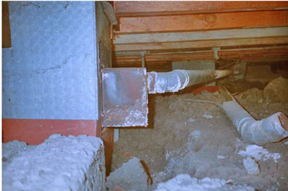
Photo 3 - Rusted Draft Hood and Discarded Old Vent

The total developed horizontal length of a single wall vent connector should not exceed 75% of the total vertical length (the height difference between the draft hood and flue termination). Dual wall/Type B vent connectors are generally allowed to be 100% of the vertical height. Long horizontal runs allow the flue gases to cool, causing condensation and improper draft. Oversized vents also impede the flow of flue gases. A common example is floor furnaces venting into masonry or chimney or Transite flue. These older vent systems may require replacement on upgrade of the heating system.