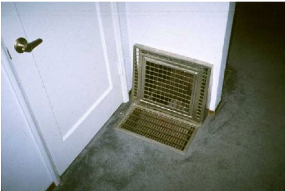
Photo 1 - Floor furnace next to door and within 6 inches of a corner

Both listed and unlisted floor furnaces should have a temperature-limiting device at the register. In unlisted systems, this should shut the system gas flow off should the register temperature reach 350°F. Older systems may not have this feature. The ignition temperature of wood is roughly 450°F to 575°F – depending on species and wood condition. However, wood damaged through pyrolysis (long-term low level heat exposure) may ignite at much lower temperatures. The intent of the temperature-limiting device is to prevent ignition and not to protect the occupants from contact burns. Even in normal operation, floor grills and registers can become very hot. Some sort of protective barrier is advisable if young children are present in the dwelling.