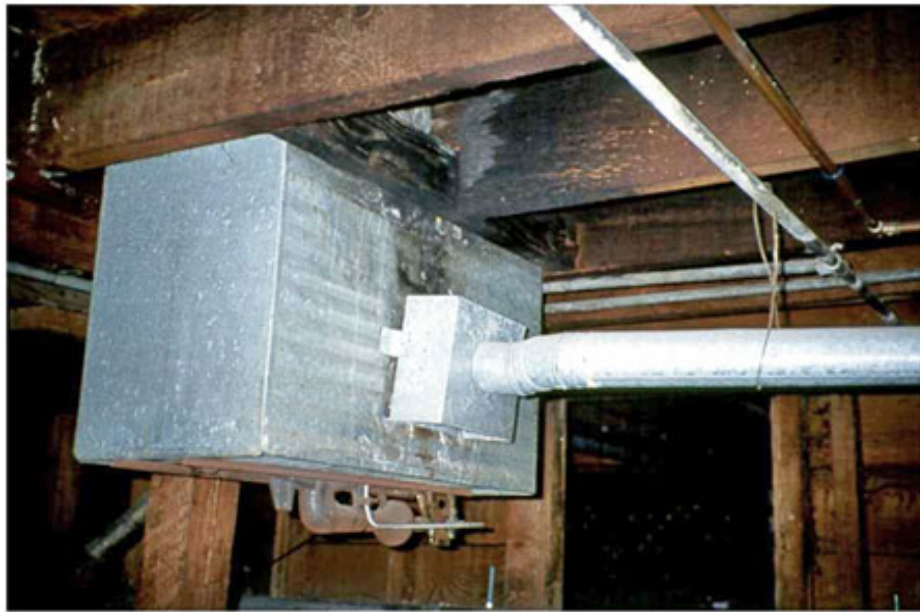
Photo 2 - Loose Draft Hood and Charred Framing

the bottom. A loose draft hood or vent connector can allow hot flue gases to escape next to the furnace, charring adjacent framing and causing fires (See Photo 2). Again, wood damaged through pyrolysis (long-term low level heat exposure) may ignite at much lower temperatures than undamaged wood. The wood color/condition adjacent to the system and all vent components should be carefully examined for indications of heat transfer. In extreme cases, the wood may be obviously charred. In some cases, the heat transfer may be less obvious and the wood may only appear caramel in color. Any indications of heat transfer should be reported. Heat damaged wood may ignite at as little as 225 °F depending on the wood type, condition, oxygen availability, etc. The flue gases may also contain high concentrations of carbon monoxide due to poor drafting and incomplete combustion, and these gases can migrate into the living space.